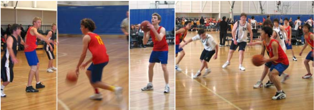
above: Images of players from the open teams at MSAC on Saturday