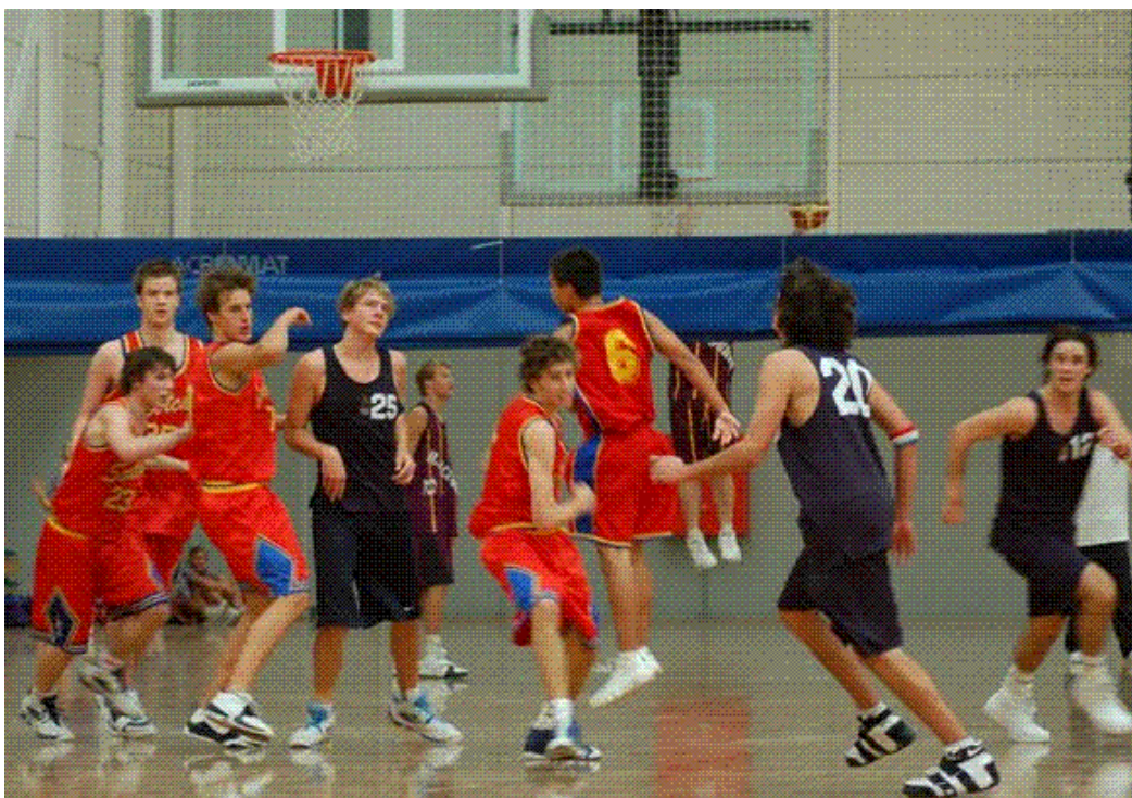
2006 SCOTCH 1sts IN ACTION!