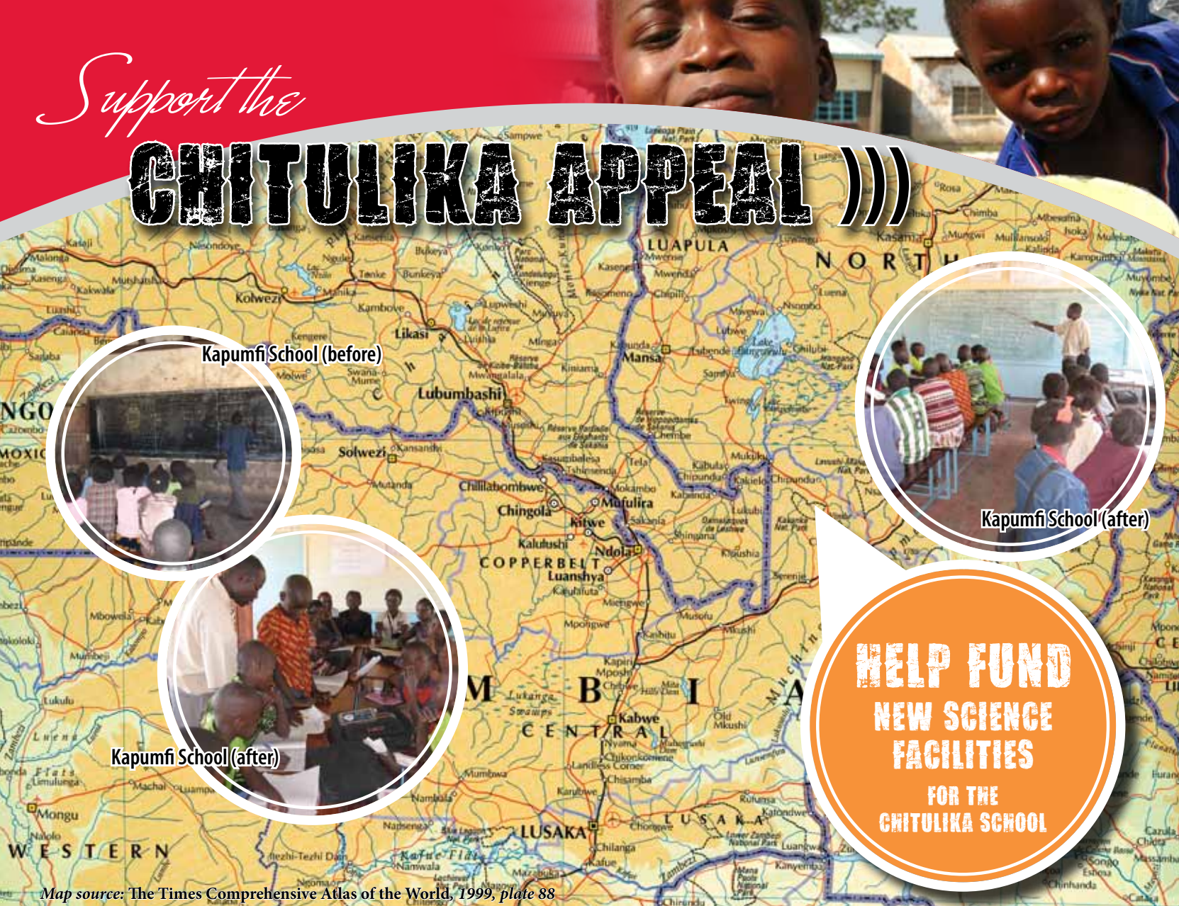
Kapumfi School (before)